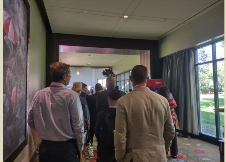
The brothers were standing behind Bo Hines (the Republican nominee for the United States House of Representatives in North Carolina's 13th congressional district)