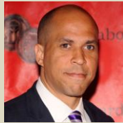
US Senator Cory Booker of New Jersey