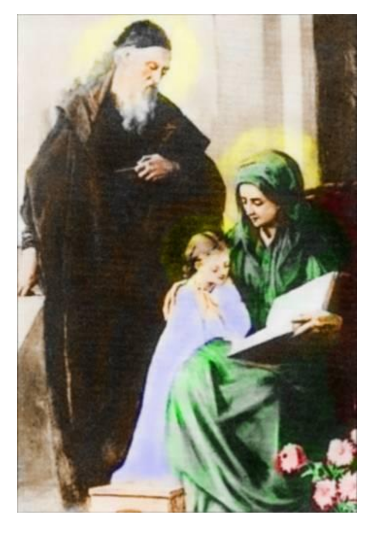
"Thou art all fair, O my love, and there is not a spot in thee." (Canticle of Canticles 4:7)

"The most High hath sanctified his own tabernacle." (Psalm 45:5)